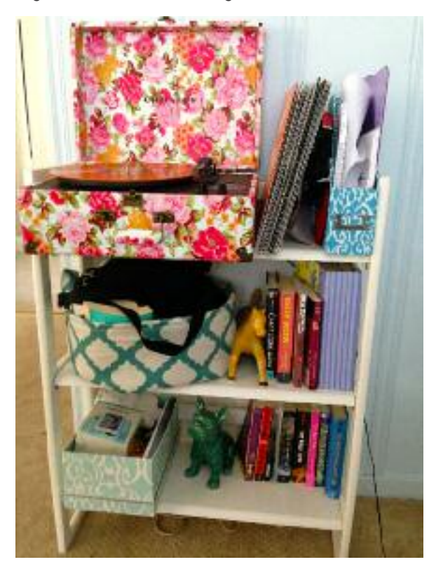
Bookcases with books are perfect for the Self Knowledge and Wisdom area of this Lafayette child's bedroom.