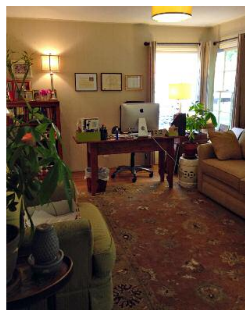
The Self Knowledge and Wisdom area is a great place for a home office.

As a feng shui healer, I recommend making very small and slow changes in any child's bedroom, but if possible try to place the desk in the Self Knowledge and Wisdom area of the child's bedroom (left side from the bedroom door). Images of mountain ranges are helpful as well to culti-